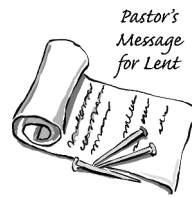
Pastor's Message for Lent

Its Holy Week... did it seem like a very quick Lent to you? It did for me. Whether we kept to our disciplines, or not, this week invites us to throw ourselves into identifying with Jesus, who so identified with you and I, that he would