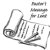
Pastor's Message for Lent

In the Scriptures this weekend, whether its Abram or Peter, James and John, we find people like us who are already journeying along with God, given a much greater insight into what God is about. Abram's trance and the fearful cloud that overshadowed the apostles are places of mystery for them. They are points of trusting further, or turning back. The implications of the promises to Abram and what the apostles hear are life changing! But that is what God intends Lenten prayer to bring about. Lenten prayer creates sacred space where we can wonder about God's hopes for me, or who I might become. God can use our openness to offer me the promises made and kept with God's people down through the centuries. Promises of faithfulness, care, and the strength we need for the changes in life we need, and deep down, we want. You and I will hear them if some of our Lenten prayer is sitting, letting Grace bring my best self to mind, and turn off the naysaying doubts that come to turn us from trusting in the promises of God.